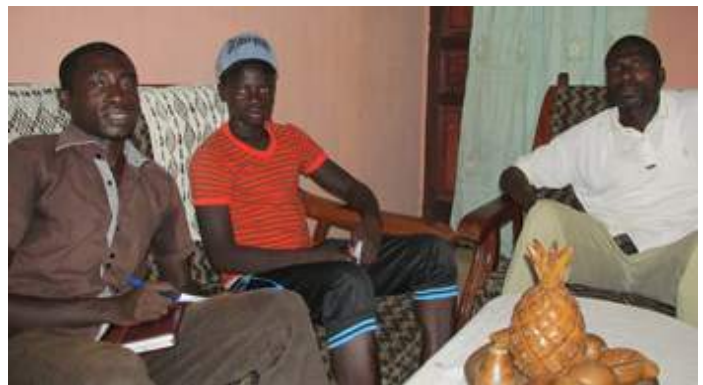
(mediation and family reintegration)